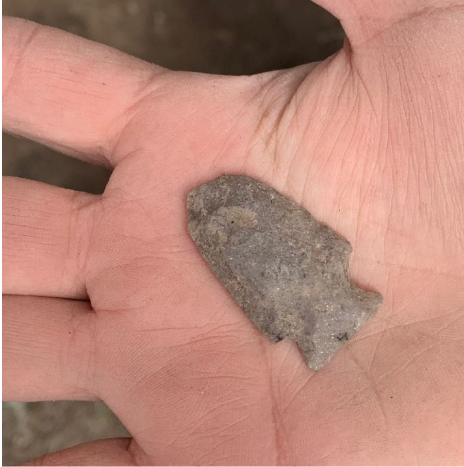
Archaic Dart Armijo Side Notched circa 5000 BC