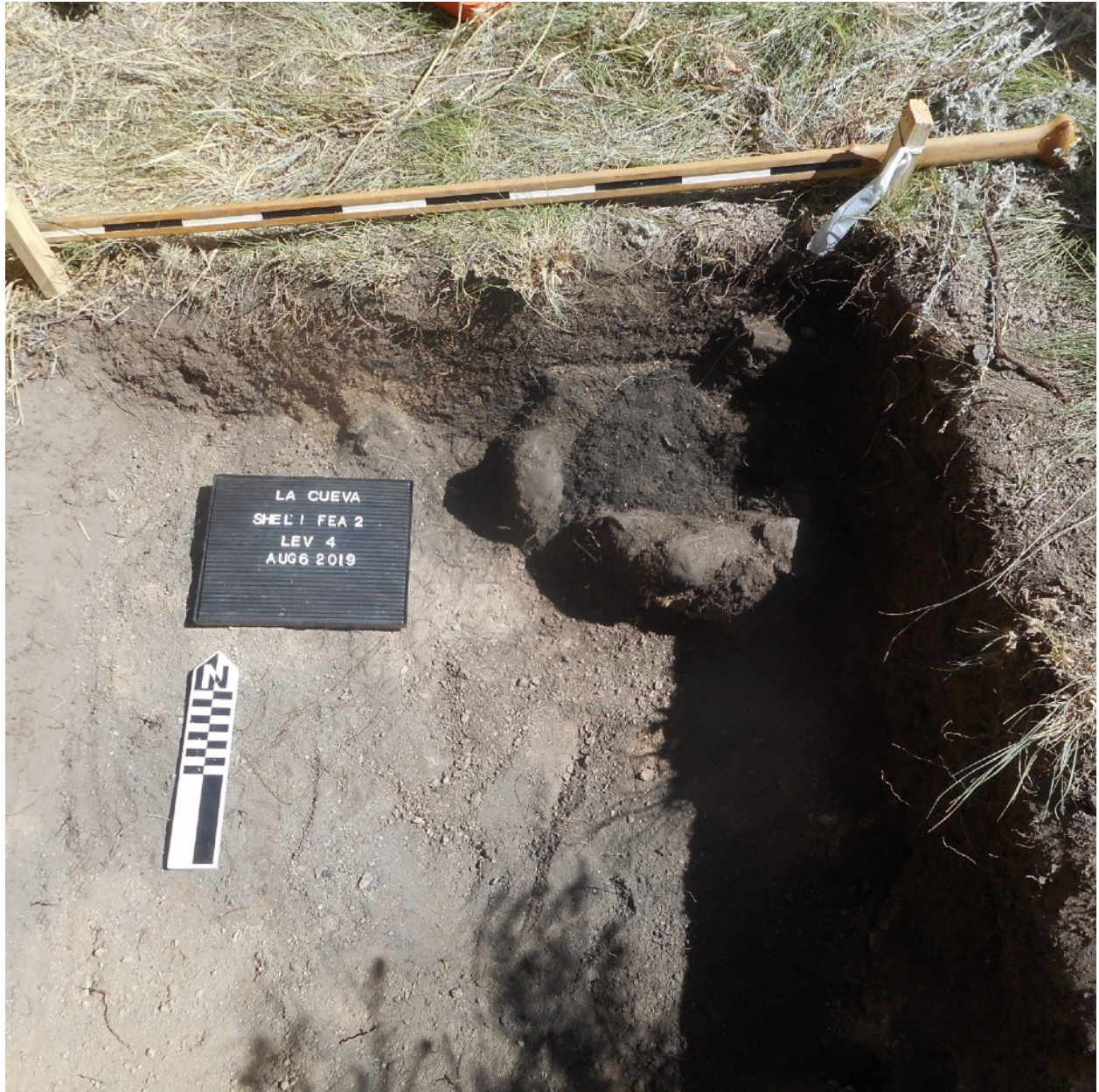
La Cueva Feature 2 Thermal Feature