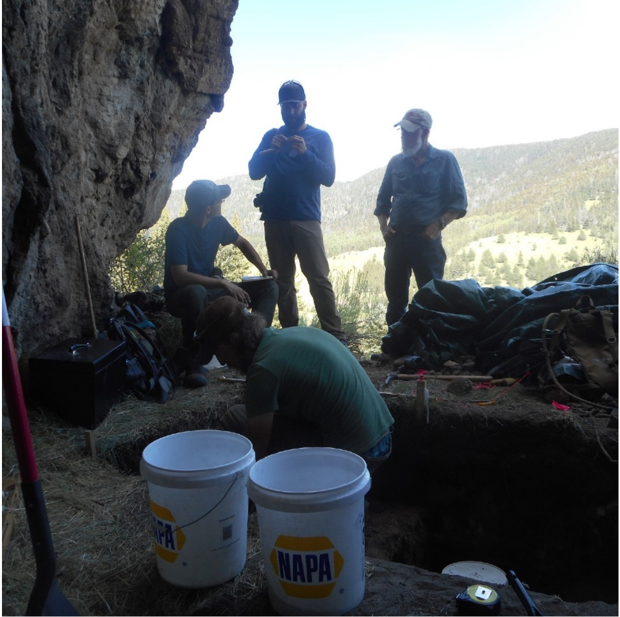
La Cueva excavation underway