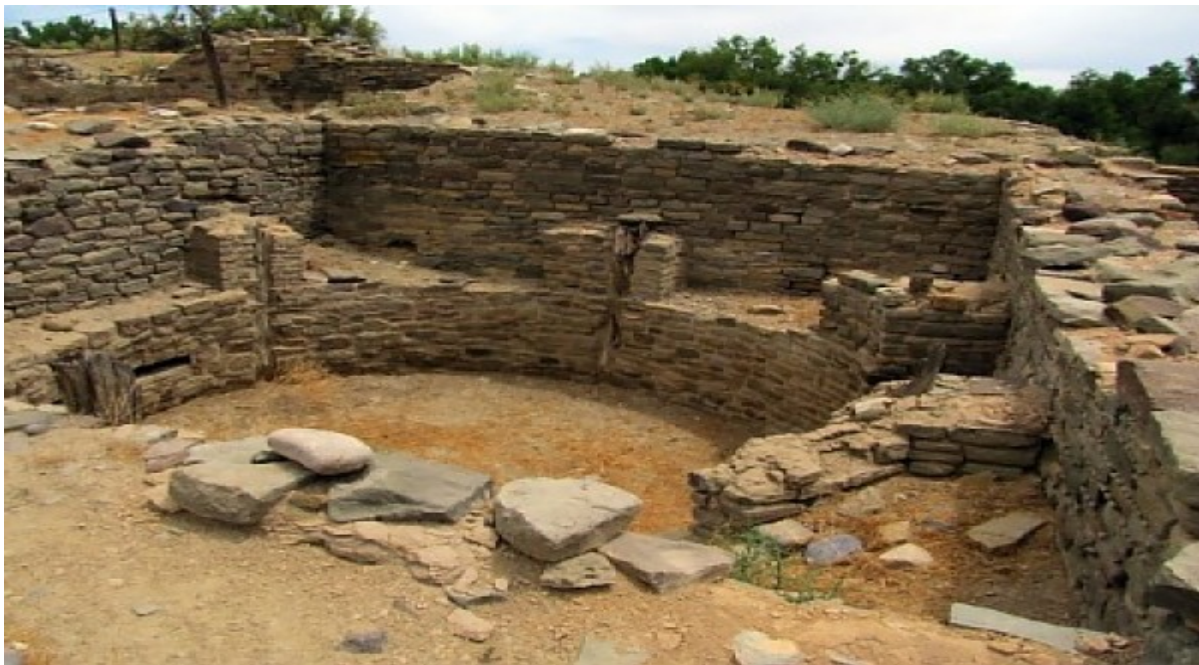
Salmon Room Block